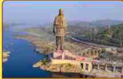
The Statue of Unity

Pavagadh is an ancient Triassic Period location with Enriched History from periods of Treta Yuga and Dvapara Yuga.