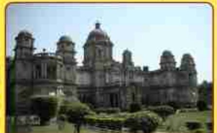
Pratap Vilas Palace

Sayaji Baug is a garden located in Vadodara, Gujarat, India. Also known as "Kamati Baug", it was built by Maharaja Sayaji Rao Gaekwad. It is the biggest garden in Western India with the area surrounding more than 100 acres.