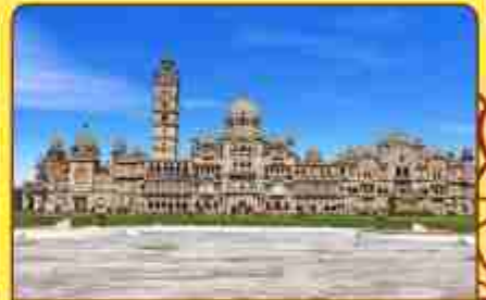
The Lakshmi Vilas Palace

Kirti Mandir, or Temple of Fame, is the cenotaph of the Gaekwads, located in the city of Vadodara.