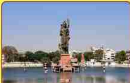
Sur Sagar Lake