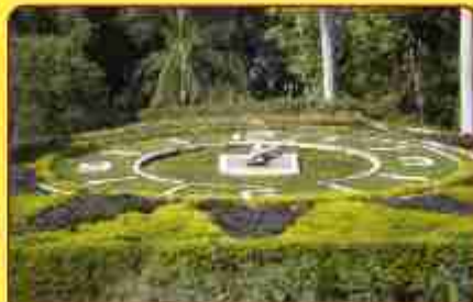
Sayaji Baug Zoo

Sursagar Lake situated in middle of the city of Vadodara in the State of Gujarat in India. The lake was rebuilt with stone masonry in the 18th Century. The water in this lake remains in it for the whole year.