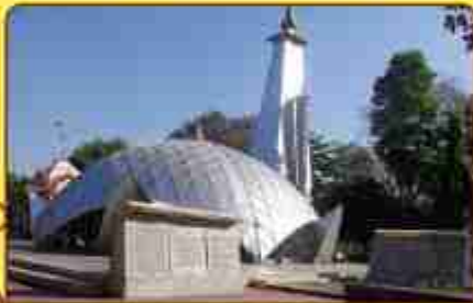
The EME Temple

Extensive religious complex with pagodas, fountains, statues & carved gates, plus a food court.